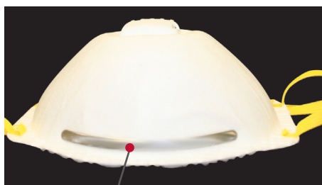
Adjustable aluminum nose bridge for a more secure fit