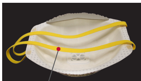
Double elastic comfort fit straps