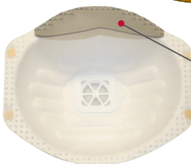
Soft foam nose for extra comfort